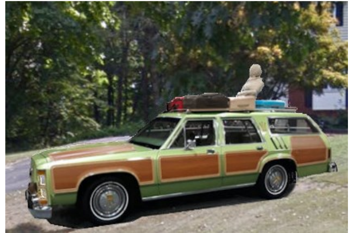
1979 Ford LTD Country Squire. Road worthy. Make an offer. Call (732) 715-0057.